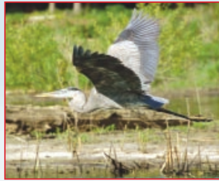
A Great Blue Heron glides across Stricker's Pond.